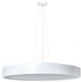
Standard pendant length: 1200mm White