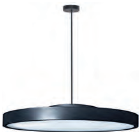
Standard pendant length: 1000mm Black