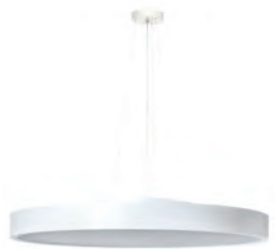
Standard pendant length: 1200mm White