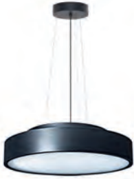
Standard pendant length: 1200mm Black