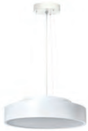
Standard pendant length: 1200mm White