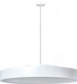
Standard pendant length: 1000mm White