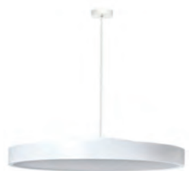
Standard pendant length: 1000mm White