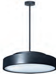
Standard pendant length: 1000mm Black