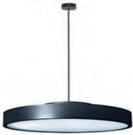
Standard pendant length: 1000mm Black