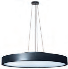
Standard pendant length: 1200mm Black