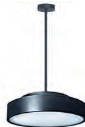
Standard pendant length: 1000mm Black