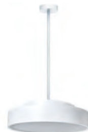
Standard pendant length: 1000mm White