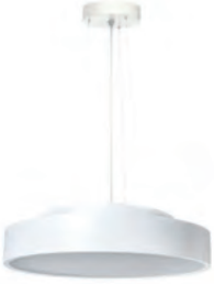
Standard pendant length: 1200mm White