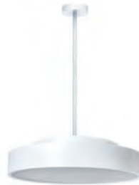
Standard pendant length: 1000mm White