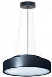
Standard pendant length: 1200mm Black